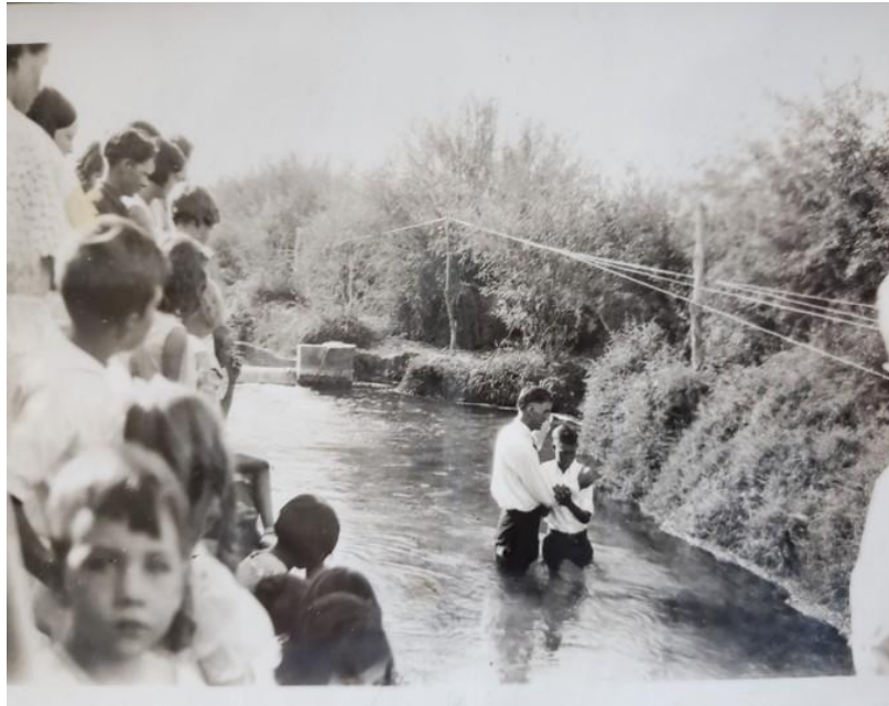
First Baptist Church of Scottsdale baptisms in the canal at Indian School and Scottsdale Road.

Next Week: How First Baptist Church of Scottsdale grew up alongside a growing city.