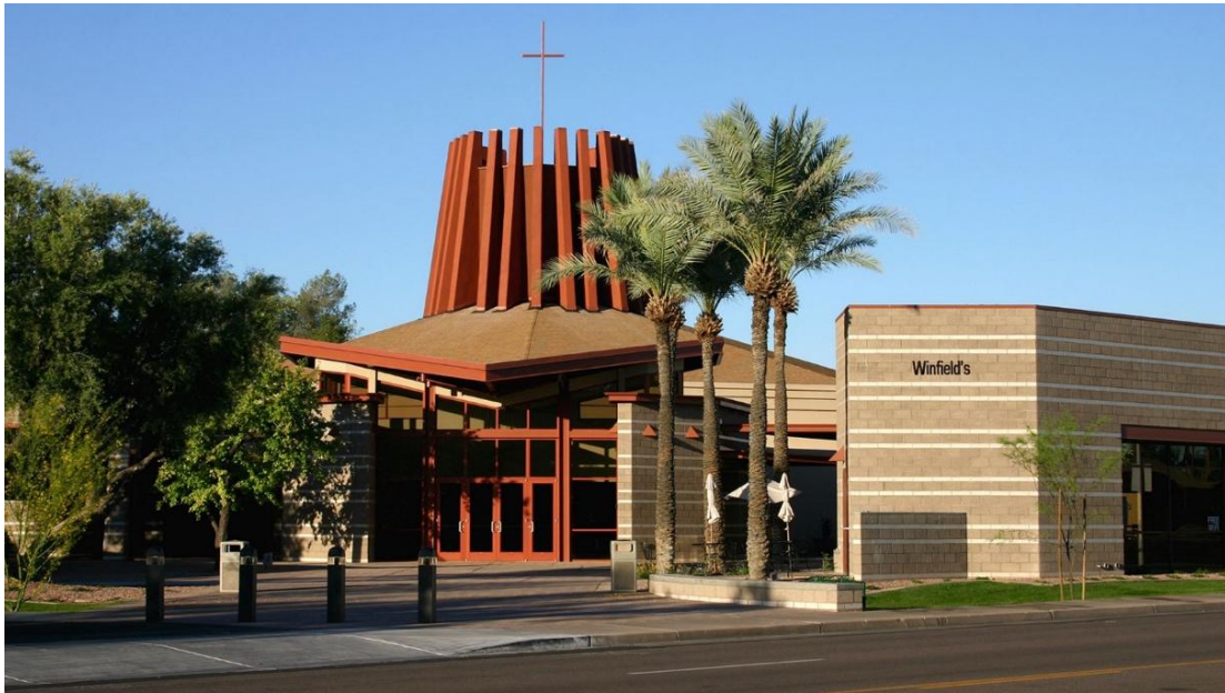
First Baptist Church of Scottsdale Today

Giving of our tithes and offerings to God is part of worship and discipleship.