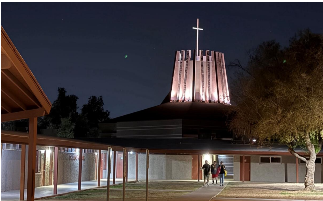
First Baptist Church of Scottsdale in 2025 with the Lantern aglow at dusk.